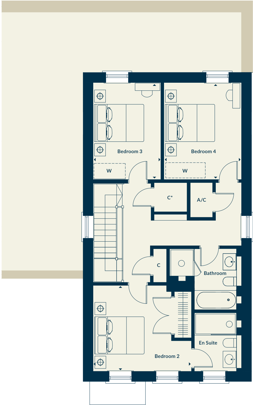
*Potential lift position